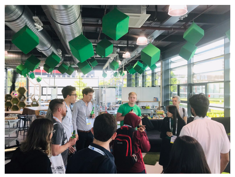
Figure 5. A tour of the DesignLab in University of Twente during the ISPRS SC event.