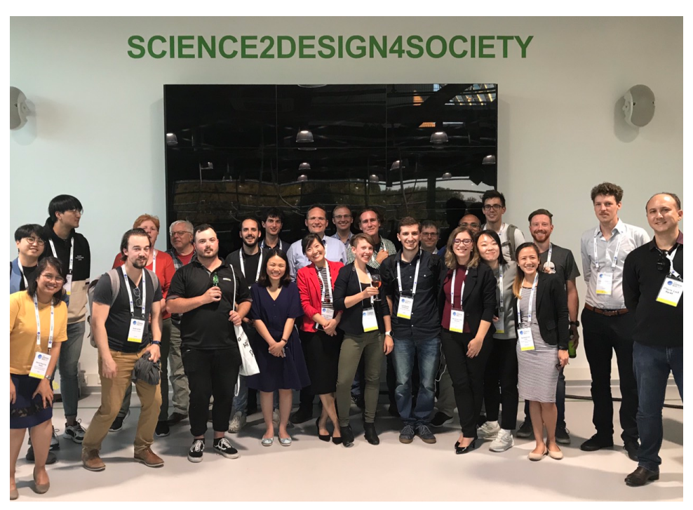
Figure 4. The participants of the ISPRS SC Students and Young Professionals Night (photo taken after the event).