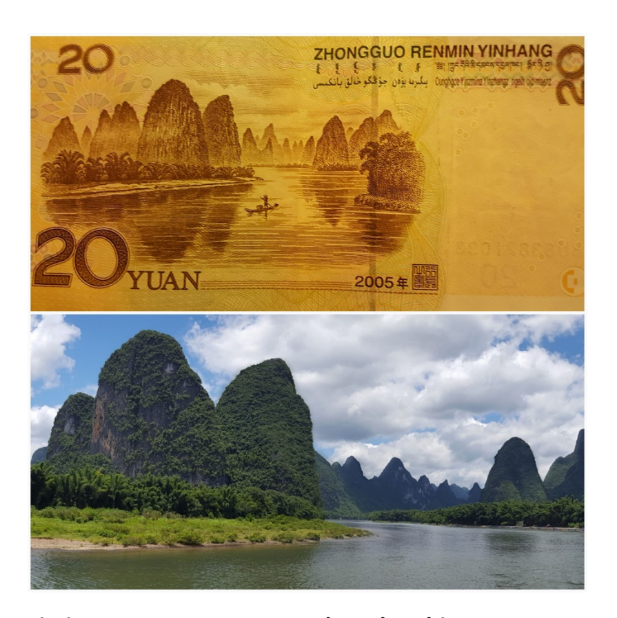
Li River scenery, as captured on the Chinese 20 Yuan note