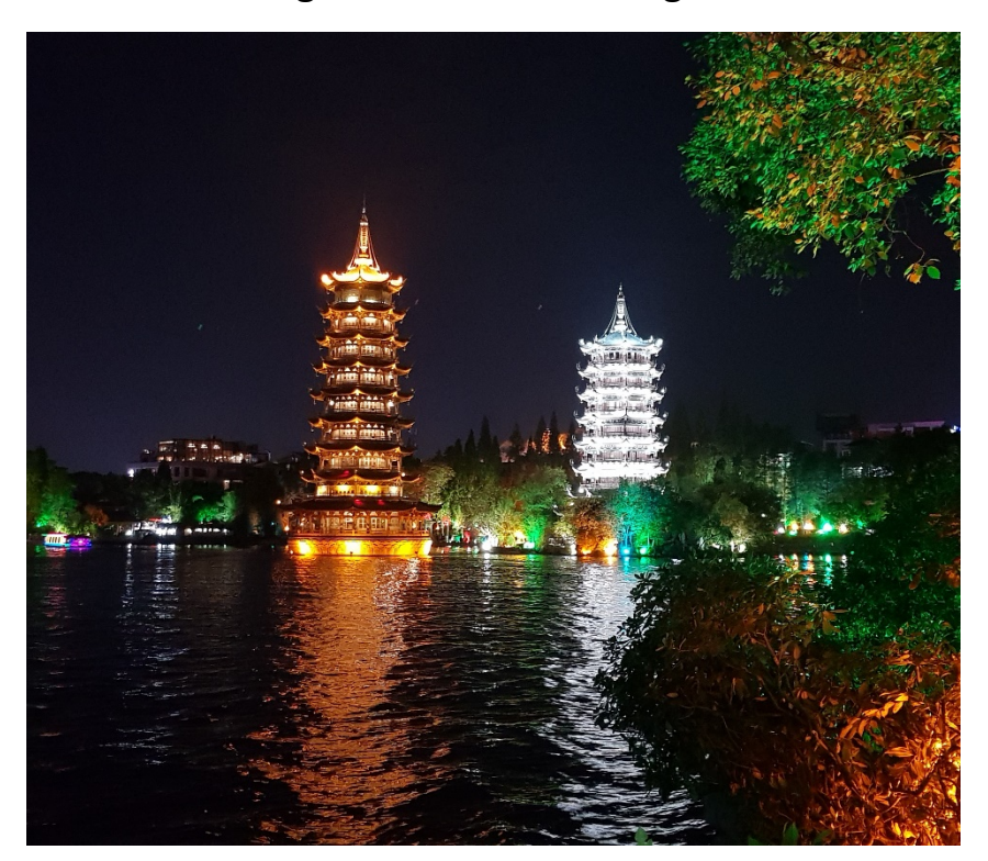
Romantic Guilin at night