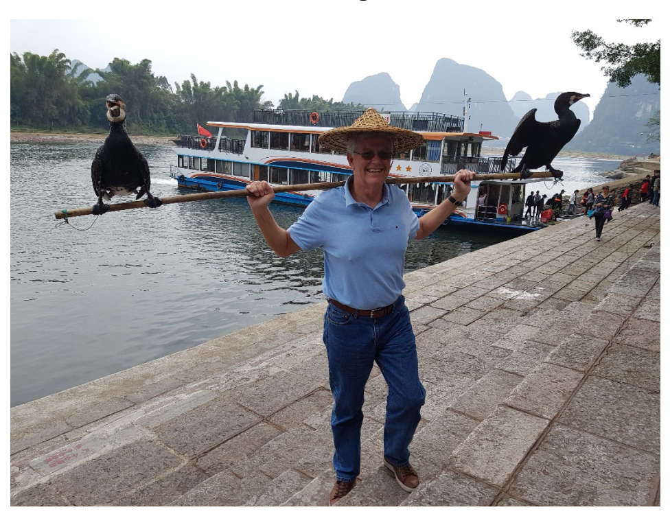
Our fisherman in Yangshuo