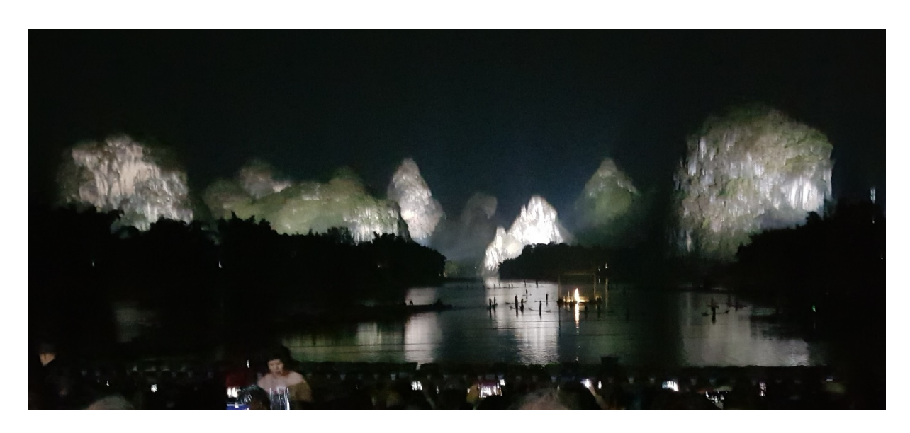
Romantic setting of the "Liu San Jie Light Show"