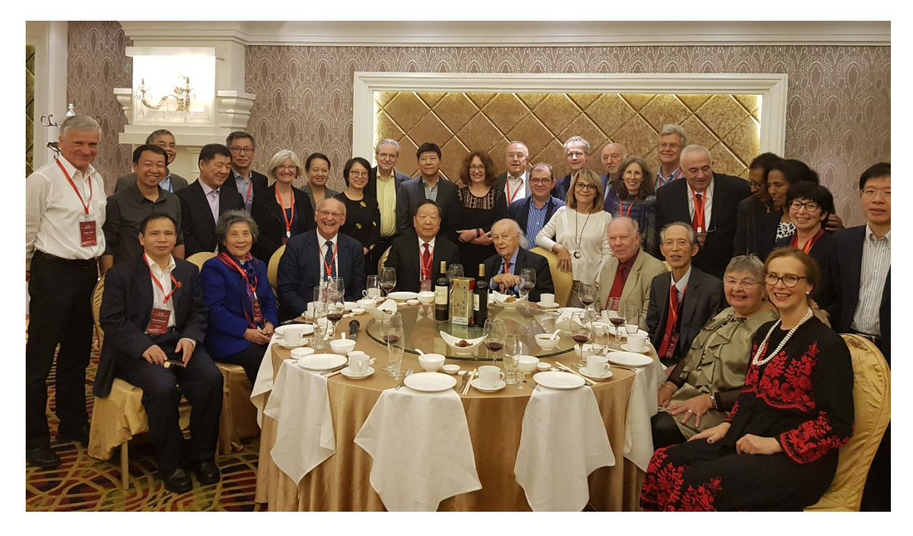
WEC Dinner with partners and friends