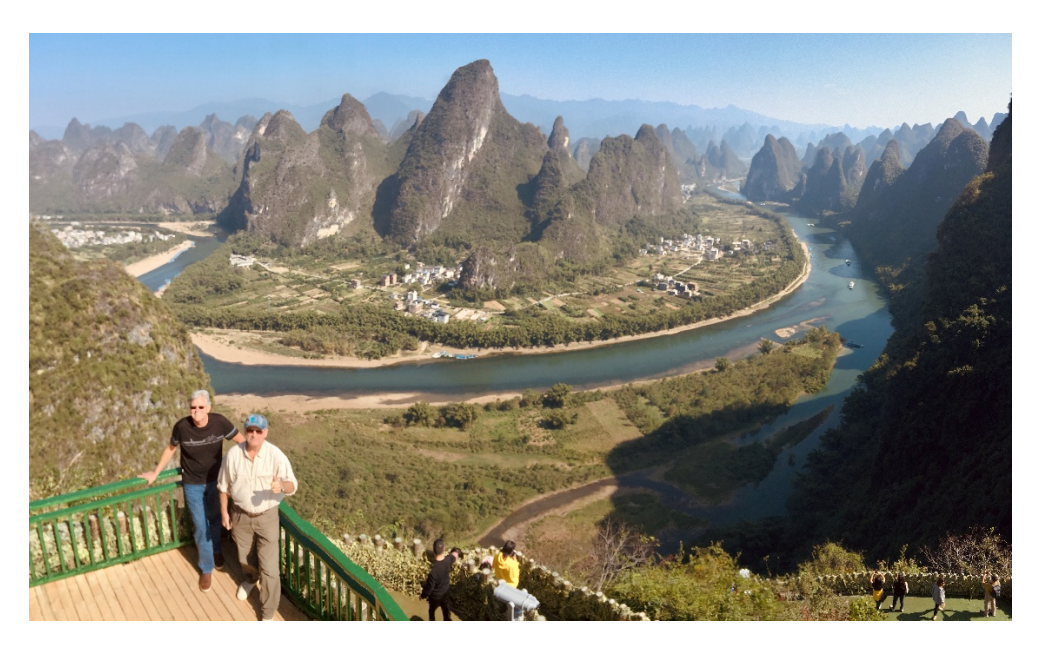
Li River bend – what a dramatic topography