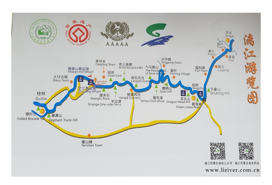
Boat trip on the Li River Guilin-Yangshuo