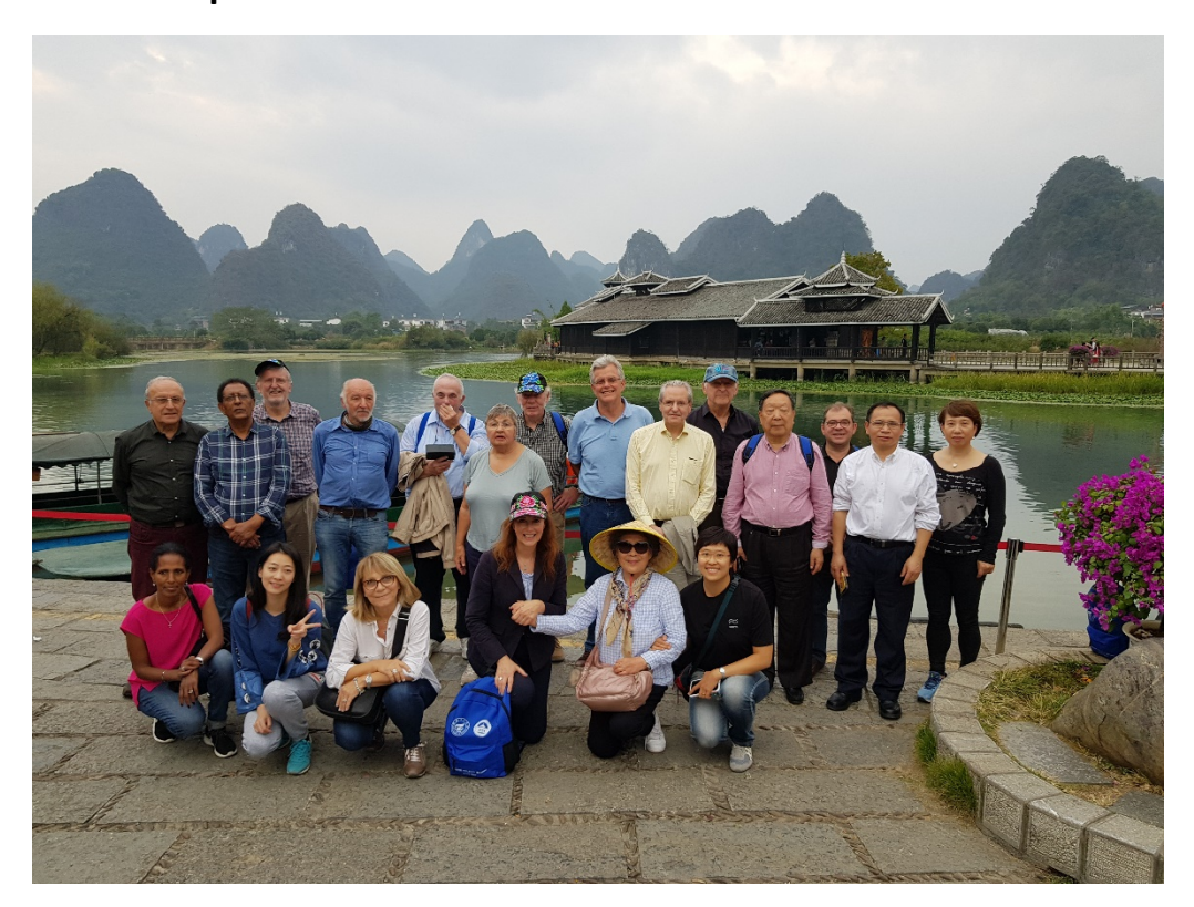
WEC with friends at a water village