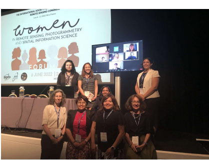
The panelists, together with the organizers, moderators and ISPRS SC Board of Directors, after the forum.