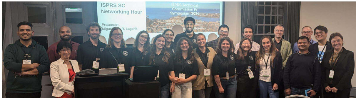
Ten SDSU-ASPRS Students at the ISPRS Student Consortium Networking Hour. SDSU-ASPRS was the only student group from the United States at the conference. Attending our first international conference was an unforgettable experience.

A SPRS student chapters play a vital role in fostering student-professional connections and establishing a collaborative geospatial community across universities in the U.S.