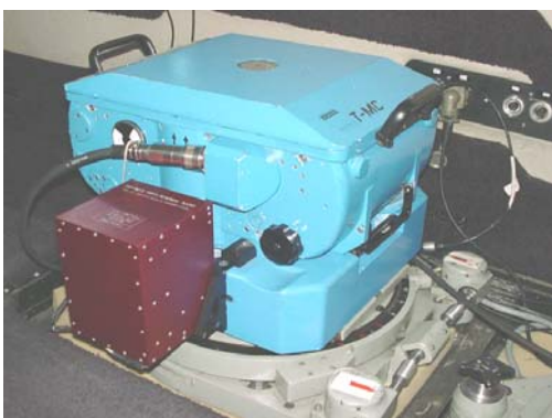
Fig. 1. Photogrammetric film camera RMK TOP (Z/I Imaging) with IMU Aerocontrol (IGI)

The most common sensors in the field of surveying and mapping is still the traditional aerial film camera. It is assumed that there are about 1000 systems worldwide available whereof about 500 cameras are in daily use (see figure 1). The typical applications are the exposures of black and white, color and color infrared images, which are used for photogrammetric mapping and interpretation. The aim of the integration of IMU's is to reduce or avoid ground control points and the production step of aerial triangulation.