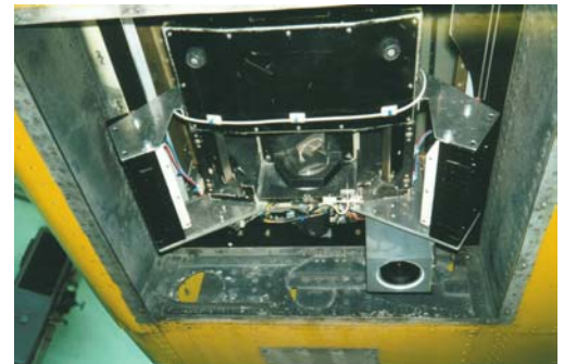
Fig. 4. Thermal scanner in Hansa Luftbild Cessna 402

Among all the different multispectral systems the thermal scanning (see figure 4) devices are used quite often for the observation and control of temperatures of different features on ground like rivers, leakage of heat pipes etc.. As the system needs to be referenced to a ground coordinate system also the GPS/INS to get the orientations of the scan lines in an easy and fast way.