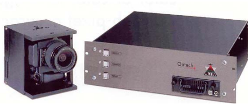
Fig. 2. Digital camera ALTM 4K02 with control unit (Optech)

The latest developments are to replace the film cameras by optical digital sensors of similar ground coverage. All of them offer or respectively need the INS for their orientation. A “small format” version can be seen in figure 2; this system has an integrated INS of APPLANIX. Some test flights and the first commercial project showed very reasonable results for special applications (see chapter 4).