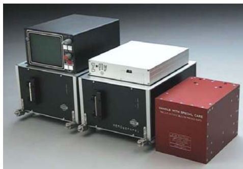
Fig. 5. Principle of direct geo-referencing Positioning (X,Y,Z) and rotations ( \omega , \varphi , \kappa ) will be captured during the survey flight Fig. 6. GPS/INS system Aerocontrol (IGI)

The components of the complete system are: