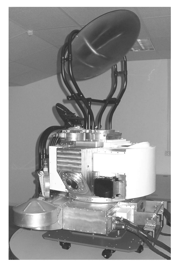
Fig 1. Optical-microwave imager/sounder MTVZA-OK.

horn antenna are mounted on a scanning platform, containing the radiometers, digital data subsystem, power and signal transfer assembly, which rotates continuously about an axis parallel to the local spacecraft vertical. The power, commands, all data, timing and telemetry signals pass through slip ring connectors to the rotating assembly.