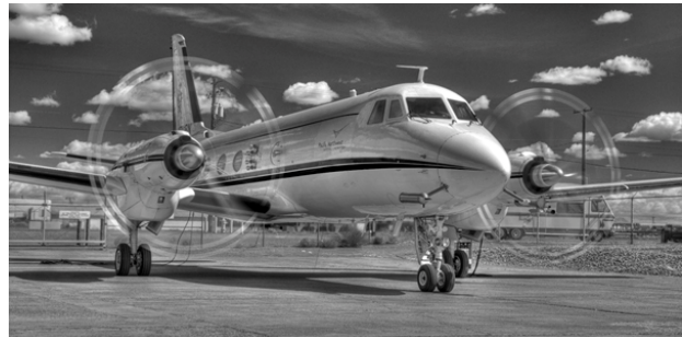
Figure 1. The AAF G-1.

The ARM Aerial Facility has recently broadened the research focus of the G-1 from aerosol and trace gas measurements to include the measurement of cloud microphysical properties and radiative properties of the atmosphere. To facilitate this enhanced scope, the G-1 has been upgraded with wing pylons to carry additional probes, with new generators and invertors that provide payload power of 77A at 115 VAC and 500A at 28 VDC, with more fuel efficient engines that increase range and maximum altitude, with a retrofitted center roof hatch modified to carry radiometers, and with seventeen new instruments. These instruments include a comprehensive suite of cloud probes with knife edge tips designed to reduce shattering of ice crystals into the sample volume. The facility also operates an isokinetic and a counterflow virtual impactor inlet for in situ measurements of aerosol and cloud properties by instrumentation located within the cabin.