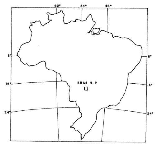
Fig.1 - Study Area Emas National Park

The Linear Mixture model and the Fuzzy Mixture model have been applied to Landsat -TM data. The study area is the Emas National Park in Brazil. The park is located in central-western Brazil at approximately 18° south latitude(figure 1).