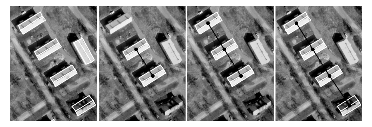
Fig. 1: Grouping a 3D-House-Row using the relations similarity and linear continuation. (3D-House-Instances generated from FLAT stereo benchmark)

Similarity: This relation may be viewed as proximity in the attribute space of the objects. For example houses, that fit into a parameterised model of the type 'simple gabled', might be viewed as similar, if they have similar height, length, width and roof angle. Also the orientation might be included. Fig 1 shows an example of successful successive exploitation of a combination of the relations continuation and similarity. In such cases also similar inter-house spacing will be demanded, so that the final parametric description of the instance 'house-row' contains much less and much more significant information, than the descriptions of the instances 'house' in sum.