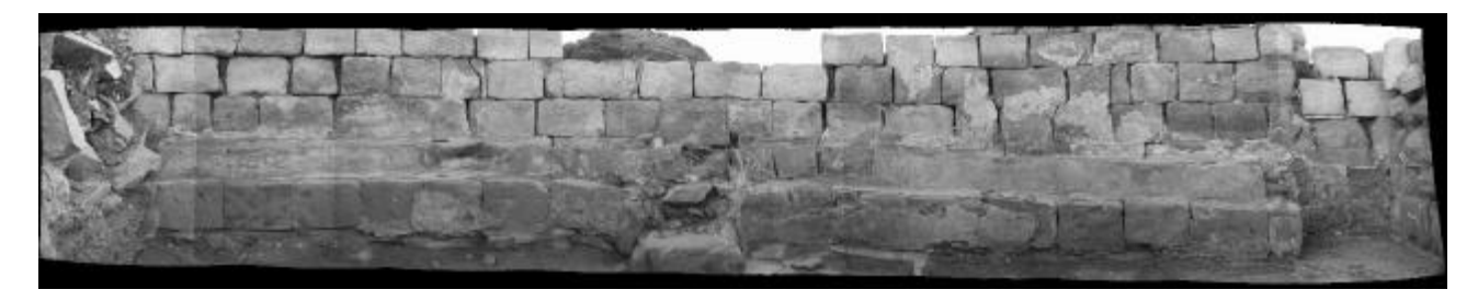
Figure 9: Panoramic image created from the apsis of the church (image processing by Jaakko Järvinen)