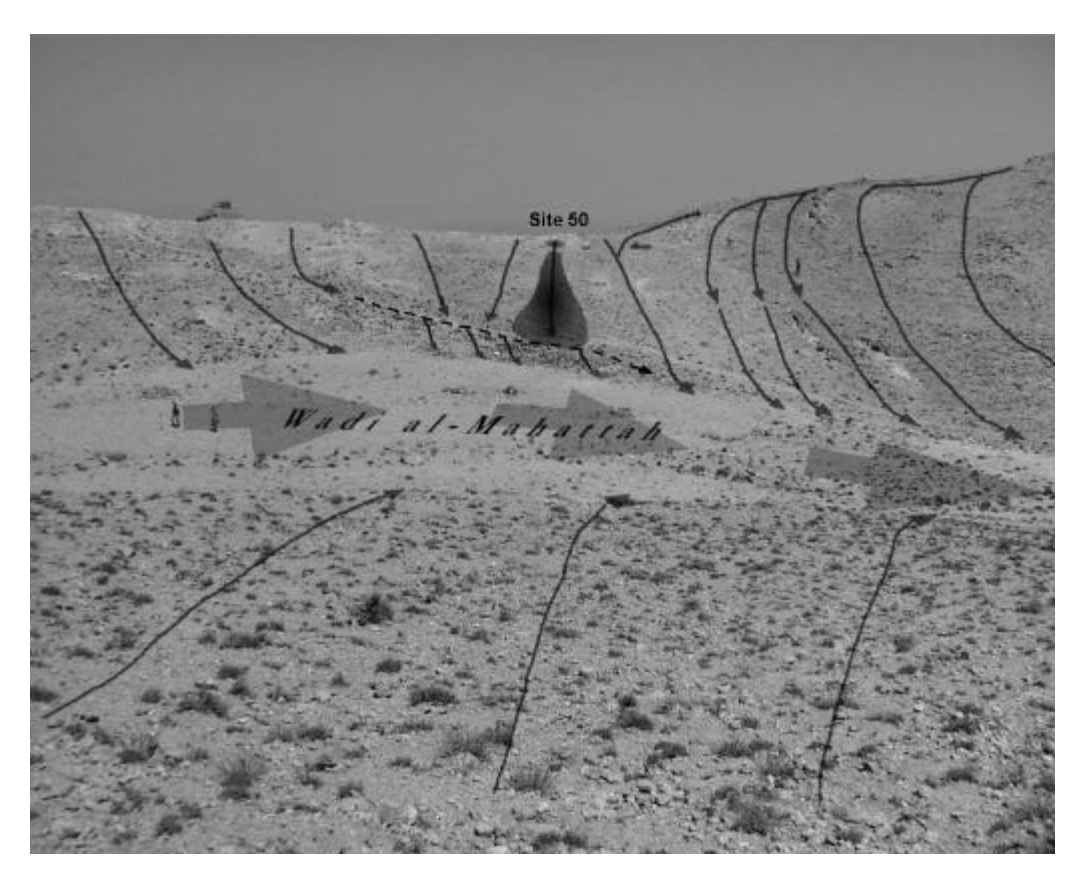
Figure 7. Digital images can be used to make notes on top of an image.