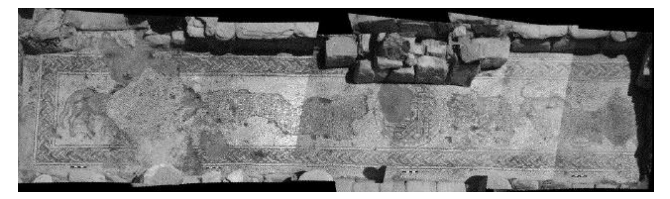
Figure 8. Photomap of the mosaic floor. The radiometric differences between images have not been adjusted. (Image processing by Jyrki Mononen)