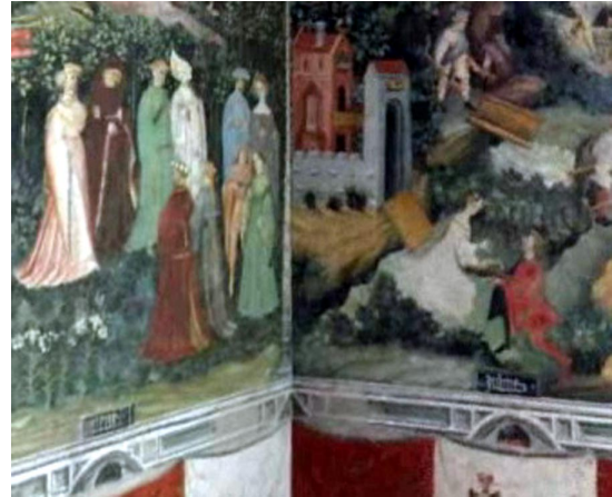
Figure 3: Corner where geometric accuracy is critical.

between the two walls. When only using a small number of points and assuming planes in areas without points, the lines along the corner did not project on the correct wall and lines that span the two walls had visible discontinuity. This shows that any small geometrical error will be visible in this class of models with frescoed walls. In most other types of architecture, where walls have uniform colours, such errors may be tolerated.