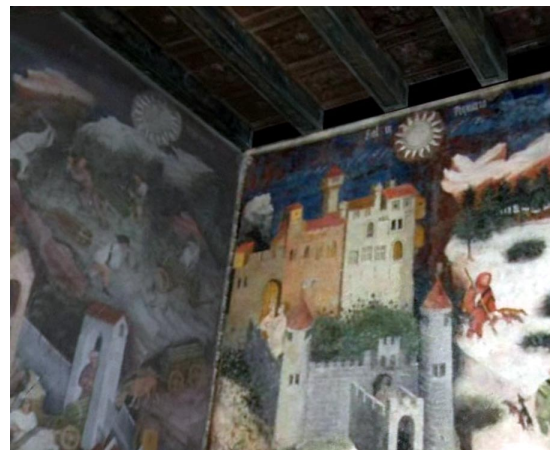
Figure 4: Lighting variations between first and last image

Without applying any texture correction, we notice in the corner where one wall texture was taken from the first image and the other wall texture was taken from the last image (the 16 th ) that there is a visible illumination difference (figure 4). This is because the difference in time between the two images was about 30 minutes, which was enough for the lighting conditions to change even though we used a flash. Corrections to this problem remain experimental and may take several iterations to achieve acceptable results, as mentioned in section 3.2.