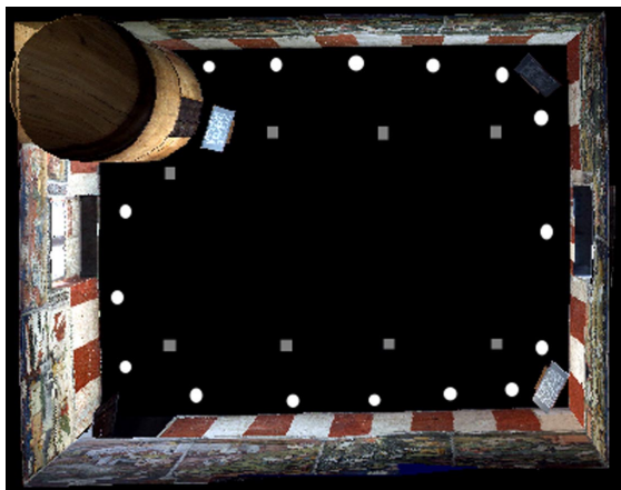
Figure 1. Room top view with camera locations.

One of the restrictions was the size of the room [7.75 m x 5.95 m x 5.35 m (H)], which resulted in a small coverage per image (without fish-eye lens). This required taking 16 images to cover the walls and 8 for the ceiling. This could take a rather long time during which lighting conditions may change and result in inconsistent illumination. For the outer tower model and the entrance to the room through the walkway, 5 and 2 images were taken respectively. This resulted in a total image size of 472 Mega-bytes. After cropping the images to the size of the triangle groups, this was reduced to about one third. The average texture resolution was 2 mm x 2 mm area of the wall per pixel. Figure 1 shows a top view of the room with camera locations for wall images (white solid circles) and ceiling images (grey solid squares).