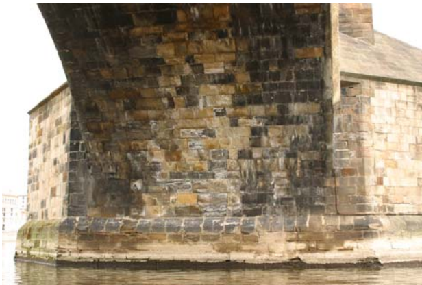
Figure 3. The Charles' bridge, image of vault

The 26 targeted control points were placed on the walls and piers and determined from points of special network that serves for monitoring of quay walls see fig. 4. The 3D coordinates of control points were determined by adjustment using module