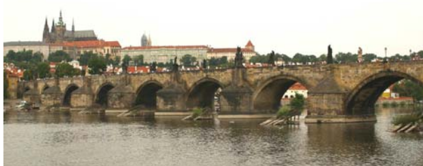
Figure 1. The Charles' bridge in Prague

The construction of the bridge was damaged several times on large floods. In September 1890 were pulled down 3 spans. The