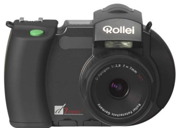
Figure 1. Rollei d7 metric 5

The Rollei d7 metric 5 is a digital single-lens reflex (SLR) camera equipped with a colour CCD sensor of approx. 5 million pixels (Fig. 1; Tab. 1; Bock & Pomaska, 2002; Rollei Foto-technic, 2003). The images can be displayed immediately after acquisition on a 2.5" colour screen to check the image quality.