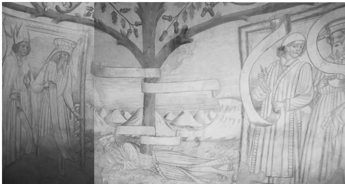
Figure 6. Scaled image mosaic of an orthographic view of the lower central part of the apse

For the evaluation of the digital photos, a new procedure for rectification of curved surfaces was applied (Stephani, 2001). Due to irregularities of the cylindrical shape of the apse one has to accept small discrepancies if an orthographic projection of the lower central part using more than one image is performed. A mosaic of two orthographically restituted images is presented in Fig. 6.