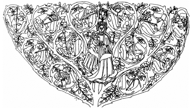
Figure 5. Drawing of the central ceiling