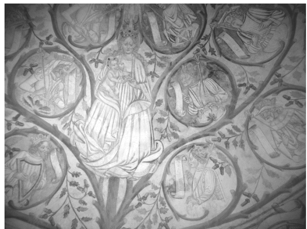
Figure 3. Image of the ceiling