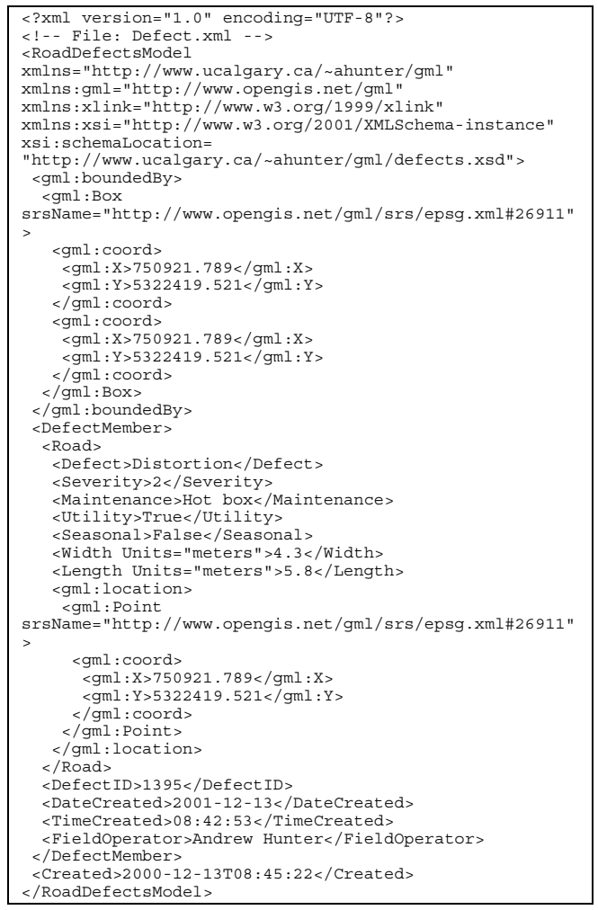
Figure 3: Defect Schema Instance

A Data Accuracy Requirements Survey was created and sent out to a number of GIS and governmental bulletin boards such as those managed by GITA, AURISA, URISA, the NZ ESRI User Group and the GISList maintained by the GeoCommunity at the beginning of June, 2001. The purpose of Survey was to determine: the spatial accuracy needs of end users; present data capture methods; "time to use" requirements and the level of validation of captured data. The survey was intended for Utility, Local, Provincial and Federal/National Government GIS project managers.