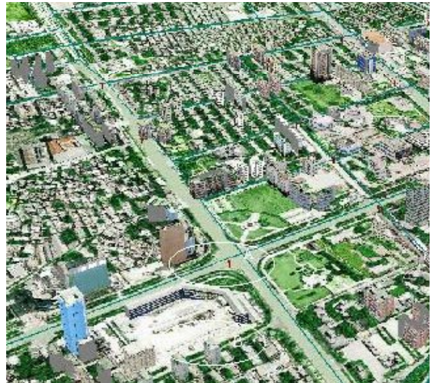
Figure 1. The part scene of a 3D city model

At this stage, the proposed monitored areas are marked on the 3D city scene. Also, an approximate number of CCTV cameras can be acquired according to the camera viewing range. Because of its fixed resolution and angle of view, the installing position of a camera can determine its view area. Typically, the CCTV camera viewing range is half a mile (for 10 to 1 zoom). Figure 1 shows the part scene of a 3D city model. Where, the white ellipse A and the white ellipse B are two proposed monitored areas.