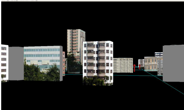
Figure 3. The 3D scene of the B camera's viewing range