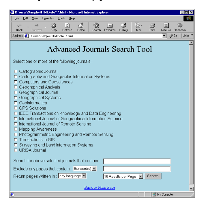
Figure 2: Advanced Journals Search Tool

One of the advantages of this tool is that user doesn't need to remember the URL address of the journals, what he/she needs is just selecting them from the list. The other advantage is that, two or more journals can be searched simultaneously. Although this tool provides user with 16 journals, however more journals can easily be added.