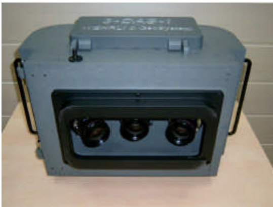
Figure 1. 3-DAS-1

Based on work done collaboratively between Wehrli & Associates and Geosystem during the last decade to develop and manufacture a series of photogrammetric film scanners, it was decided in 2001 to continue this collaboration with the development of a digital airborne scanner for the direct acquisition of digital photogrammetric imagery. The 3-DAS-1 is based on the well known three line scanner principle, hence the acronym. It is designed to address the civil mapping market. Wherever possible, all components of the system have been selected to modular, COTS (commercial off the shelf), and upwardly mobile. A pre-production model of the system has been completed, see Figures 1 and 2, and laboratory evaluations have been carried out. At the time of writing, first airborne data is about to be collected.