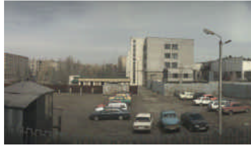
Figure 5. Terrestrial image from 3-DAS -1

shows a zoomed in detail of the antenna mast in the background. The antenna was 2.3 kilometers from the camera.