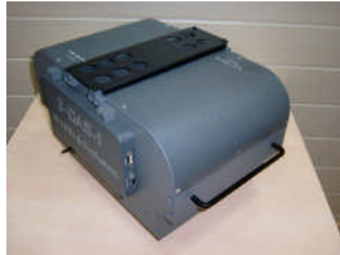
Figure 2. 3-DAS-1