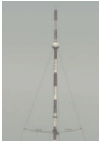
Figure 6. Close-up of antenna