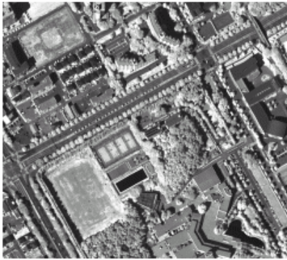
Figure 1. ADS 40 NIR image with shadow regions

The present work utilized the mean-shift analysis (Fukunaka and Hosteler, 1975; Cheng, 1995; Comanicu and Meer, 2002) filtering and segmentation for shadow region extraction from high-resolution air-photos. The lowest mean lightness parameter added to the segmented image finally will automatically extract the shadow regions. Since shadow regions are the darkest regions, applying the lowest mean lightness value to threshold the segmented image will extract shadow regions. Panchromatic (PAN-grey level) was used as input. ADS 40 NIR image covering a part of northern part of Tokyo (figure 1) was tested and significant results obtained.