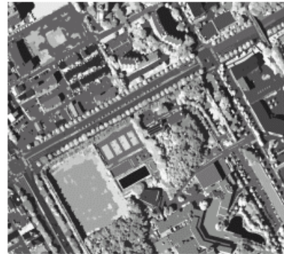
Figure 2. Filtered image

observed that all the dark pixels are not shadow regions as some of them represent water bodies (A in figure 3), dark coloured roofs (B in figure 3), newly paved tar roads and similar objects. Figure 4 shows the texture information in the shadow regions. The adaptive contrast enhancement helped to enhance the shadow regions and finally an integration of the shadow texture regions with the shadow-removed image resulted in a shadow-free image (figure 4).