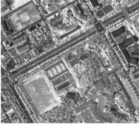
Figure 5. Shadow free image