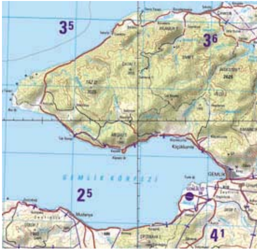
Figure 5. Cartographic visualization of VMAP L-1 database based on JOG specifications (this graphic is used for production of analogue map)