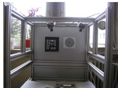
Figure 2: Camera configuration

The system was arranged convergently at a distance of approximately 0.50 m from the concrete sample (Figure 2). Concrete specimens having the dimensions of 40x40x220 mm were used for the experimental study. Measurements were carried out on the specimen, which had not been demoulded, to obtain the fresh state behavior.