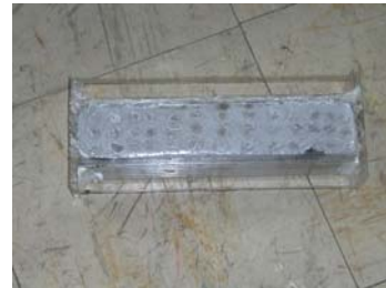
Figure 1: Concrete sample

The system was arranged convergently at a distance of approximately 0.50 m from the concrete sample (Figure 2). Concrete specimens having the dimensions of 40x40x220 mm were used for the experimental study. Measurements were carried out on the specimen, which had not been demoulded, to obtain the fresh state behavior.