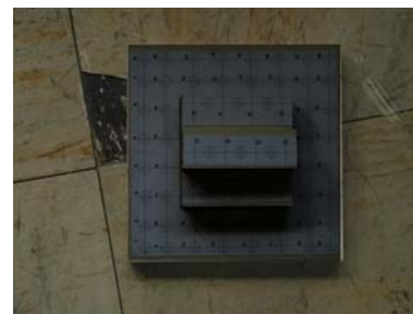
Figure 3: Calibration object

A step calibration target plate is employed that provides a three-dimensional target field, as shown in Figure 3. The calibration object was taken at a distance of approximately 50 cm and at the principal distance of 16 mm from the CCD camera from 8 different directions and positions.