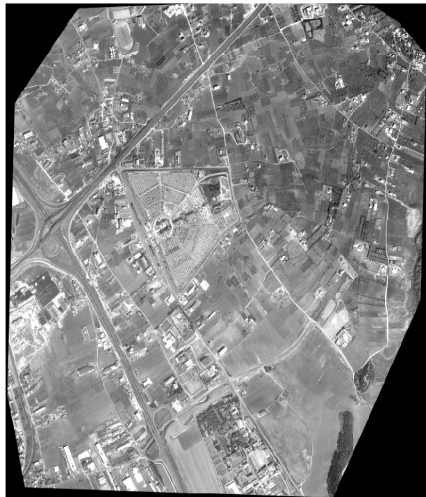
Figure 2. The panchromatic orthoimage using control points digitized from map.

With those errors considered bearable, the final step was the image resampling with the Cubic Convolution method of the rectified image and the production of the orthoimage. (Figure 3)