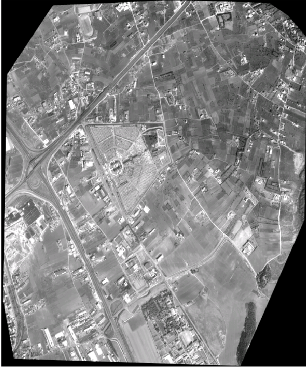
Figure 3. The panchromatic orthoimage using control points measured with GPS.