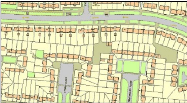
Figure 1: Extract of OS MasterMap data Ordnance Survey © Crown Copyright. All rights reserved.

- The Integrated Transport Network™ (ITN) Layer contains a network of road centre lines, and some routing information (like one way restrictions for example).