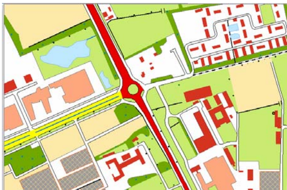
Figure 2 Fragment of the TOP10NL dataset

At the moment all 1:10k data sets are converted into the new TOP10NL model, which is expected to be ready at the beginning of 2006. An example of TOP10NL data is shown in figure 2.