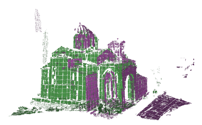
Figure 2. Coarse registration result for Northeast (green) and North (purple) positions.