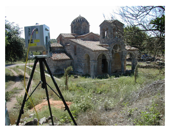
Figure 1. Agia Sanmarina and the Cyrax laser scanner.

Introduction This is an extension of the pairwise fine registration method shown in (von Hansen, 2007b). Opposed to the previous formulation where one dataset was kept fixed, the method