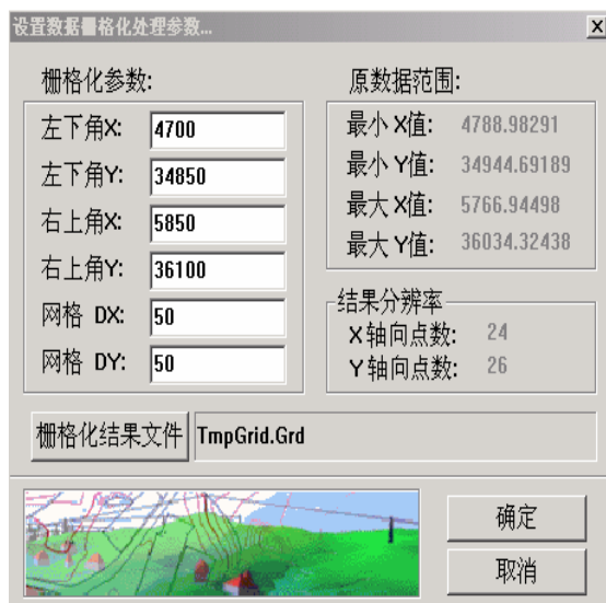
Figure 2. The main parameters of grid network