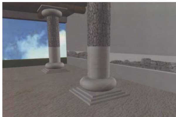
Fig. 3- Reconstructed format of columns with their decorative stucco