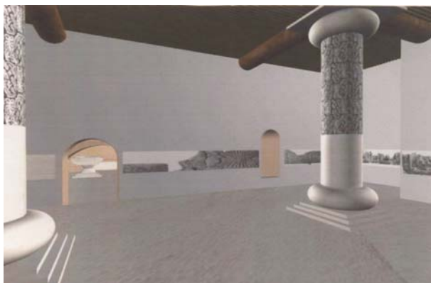
Fig.1- A reconstruction of columned hall