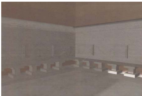
Fig. 2- Reconstructed format of ossuary chamber

This room is located in the western part of the hall with columns. Entry of the hall was shown with arched roof and the height of entries appraised 1.80cm (figure 2). As mentioned above, the obtained height of the walls of the building is around 1m. and there are no signs indicating the existence of windows in the building. Since the room became too dark due to the lack of window, a window was devised in the wall. Shape of the window was inspired by those with arched roof used by Huff (1987) in reconstructing buildings like Firouz Abad of Fars Province.