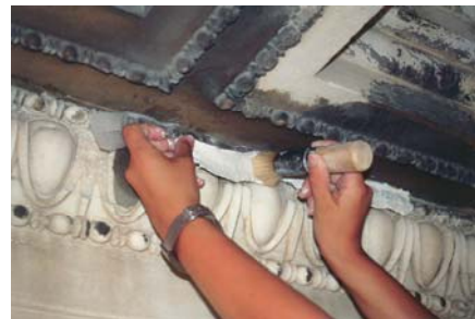
Figure 1: Consolidation of the surface

Acropolis monuments (the Parthenon, the Propylaia, the Erechtheion and the Temple of Athina Nike) can be divided in rescue and systematic interventions. All the materials used are inorganic, reversible and compatible with the marble. The rescue interventions include the preconsolidation of the deteriorated surface and the "facing" of friable areas with Japanese paper, gauze and methylcellulose adhesive (Figure 1). Wherever the marble exhibits sugaring, the surface is consolidated by being sprayed or impregnated with a solution of lime with the addition of calcium carbonate for the faster carbonation of the material. It is noted that about forty sprays are adequate for surface consolidation. The cracks and the interior gaps are cleaned using air or deionized water and hydrogen peroxide.