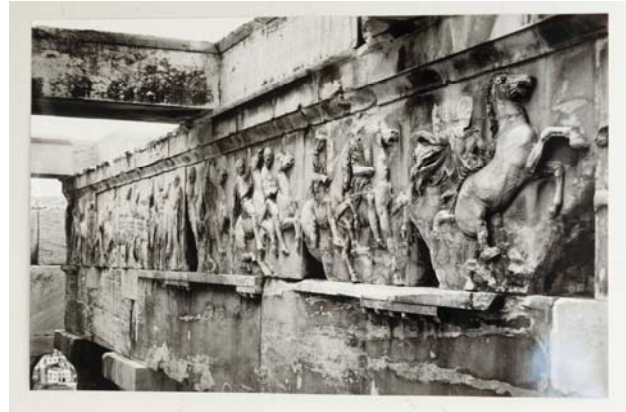
Figure 4. The Parthenon West Frieze on the monument