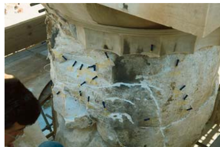
Figure 2: Injection of grouts