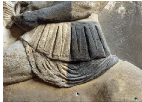
Figure 8. Detail during the laser cleaning