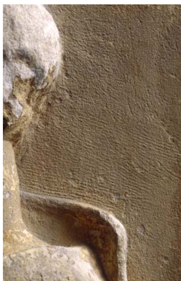
Figure 10. Ancient tools' traces