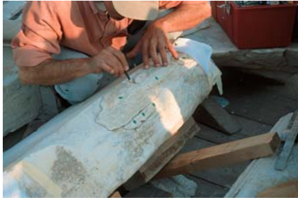
Figure 3: Reattachment of fragments

They are then filled by injecting according to the strength required, cement, cement-lime or hydraulic grouts of high injectability consisting of white Portland cement, fine-grained pozzolana (Santorin earth) and water in a ratio of 75:25:80 (Figure 2). The grout is stirred in an ultrasonic agitator and applied to the cracks through small tubes. The large fragments that had become loosened or detached from some blocks, are reattached with white cement and reinforced with titanium dowels wherever this is considered necessary. When small flakes are to be attached, a mortar of reduced strength is used consisting of cement and lime with the addition of calcium carbonate in order to accelerate the hardening of the mortar (Figure 3). For shallow cracks as well as after attachments or injection grouting, the joint is sealed with a mortar made of cement, lime, quartz sand and iron oxides as pigments for the chromatic harmonization with the ancient marble. The mortar is in a ratio of 1:3 binder to aggregate. The brass pins are removed and replaced, if needs be, by new pins made of titanium. The old mortars were removed using masons' and dentist's tools. The whole process is well documented through a series of photographs and graphic mappings before, during and after treatment of individual areas.