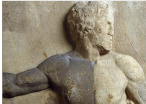
Figure 7. Detail during the laser cleaning

Once they have undergone conservation the West Frieze blocks were not replaced on the monument but were instead exhibited in the Acropolis museum. Copies made from artificial stone were put in their place on the monument.