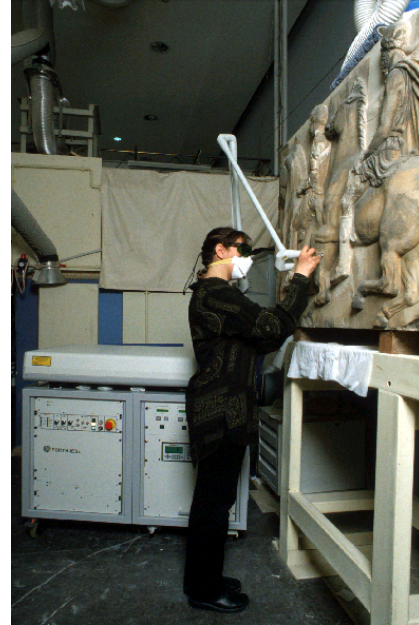
Figure 6. The laser system

the option of using the two laser beams individually or in combination and in various ratios of energy densities. This made possible to combine different cleaning methodologies to adjacent areas of the surface to be cleaned with no profound colour or structural differences.