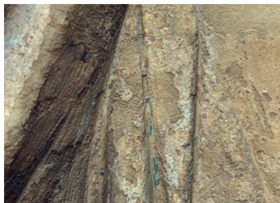
Figure 11. Ancient colour traces