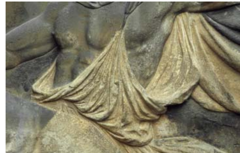
Figure 9. Detail during the laser cleaning