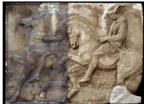
Figure 10. During the laser cleaning