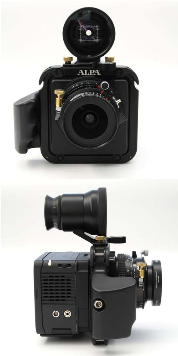
Figure 1. ALPA 12 TC with decentred Schneider Apo-Digital and Leaf Aptus 75 digital camera back.

in terrestrial photogrammetric cameras like the Wild P31 and P32. Possible applications for a digital camera with decentred or shifted principal point have been summarised by Rieke-Zapp (2006).