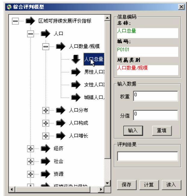
Figure2. Comprehensive evaluation model

Figure 2 depicts the effect using fuzzy comprehensive evaluation model to assess comprehensively sustainable development.