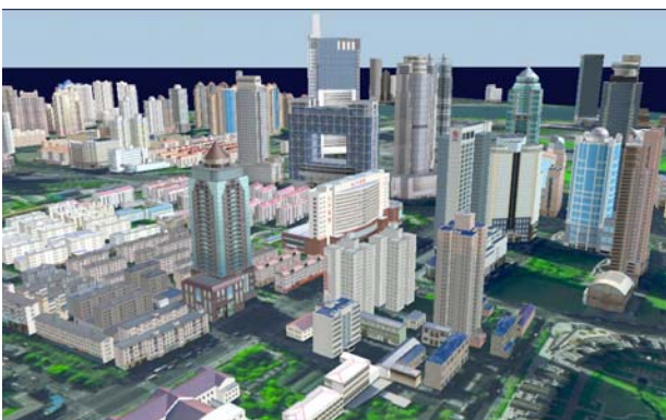
Figure 3. The three-dimensional model of Lu Jia zhui area of Shanghai with the texture