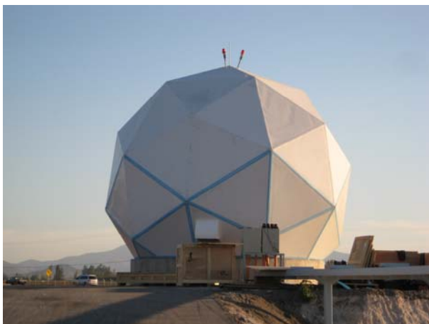
Figure 3 SAF Ground System Antenna

The Ground Station Antenna is installed, in SAF facilities, at the Santiago International Airport. The SAF Ground Station is providing the capacity to receive the data from high resolution satellites, multiespectral and hyperespectral satellites covering Chilean territory. There are separate Command and Data Acquisition area, providing the capability for monitoring and control a commercial satellites constellation. In addition the data are transmitted from the ground station to the SAF Production Area for processing, archiving and further distribution to users. Communication from the Ground Station to the Production Site is via a fibre optic link. The ground station system provides the capability to capture geographical data and process them.