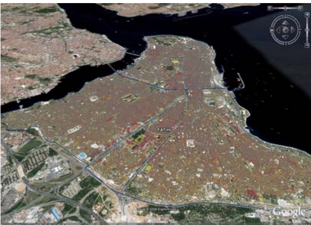
Figure 4 : Represent of the all the project area on Google Earth with 3d buildings

The three dimensional geographic information system formed in the historical peninsula along the borders of the city Istanbul was presented on the Internet. Moreover, the models of Ayasofya, Sultanahmet Camii and obelisks at the hippodrome which had been prepared in the Google Sketch Up programme were integrated into Google Earth programme. In the Figure 4, there can be seen the new positions of the historical works' three dimensional models prepared in the Sketch Up programme.