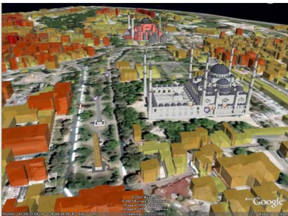
Figure 3 : Represent of the 3D model on Google Earth

separate coloration processes were carried out according to factors, the data whose symbologies had been determined were turned into three dimensional data with the additional software Export to KML Extension V.2.3, were saved as KML format which is an extension of Google Earth programme, for the three dimensional projection of the land and the buildings on it the Arc Scene programme which is also another software of the firm ESRI was used, finally the buildings within the historical peninsula on which all these processes had been applied were transferred as KML format to Google Earth programme which is one of the most popular and useful programmes these days. In the Figure 3, there is a section of the three dimensional model made with this programme.