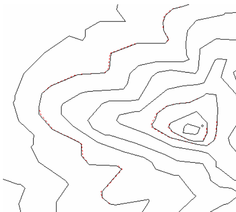
Figure 5 the imperceptibility for the embedded watermark data

Figure 5 shows the embedded watermark data overlapped with the original data, where the solid lines is the original contour data and the hidden lines is the embedded watermark data. From the comparison of the two kinds of data in Figure 5, it can be known that the proposed watermarking algorithm is with good imperceptibility.