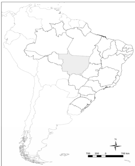
Figure 1. Location of the Brazilian State of Mato Grosso.

In this work, it is thus proposed that a technique based on the same principles may be applied to MODIS temporal imagery in order to enhance classification results for agricultural areas with large fields, as is the case for the study region in mid-western Brazil. As such, it is suggested that the influence of noisy or disturbed pixels can be minimized, and a much more consistent and useful result can be attained, if individual agricultural fields are identified and each field's pixels are analyzed collectively. For that matter, a special methodology is presented here that is capable of taking advantage of the cleaner and more reliable samples within each segment, as opposed to those more affected by noise and thus more prone to lead to misclassification.