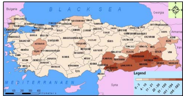
Figure 2. Choropleth maps of morbidity rates of Typhoid fever (1:100000)

Since the incidence rates were aggregated into the aerial units of provinces, an important aspect is deriving spatial weight matrix (W) for ESDA. The spatial weight matrix is the fundamental tool used to model the spatial interdependence between areal units. Determination of the proper W matrix is a difficult and controversial topic in spatial analyses. There are several techniques for deriving W such as simple contiguity that sharing a border, distance bands that locations within a given distance or general social distance, according to the aim of the studies in literature (Anselin et al., 2006, Shi et al., 2006).