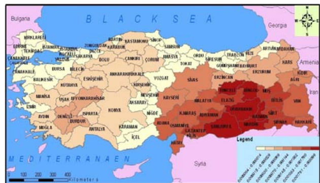
Figure 3. Choropleth Map of spatial rate smoother values

In this study we formed the weight matrix based on the criterion of contiguity with 6 nearest neighbour. After data smoothing were constructed, a spatial rate smoother based on the notion of a spatial moving average was constructed for explorative spatial data analysis. The purpose of integrating spatial rate smoother method is to emphasize global variations and trends in the health data. These rates of incidence showed that there seems to be a trend towards the South and Eastern Anatolian regions for the cases of typhoid fever (Figure 3).