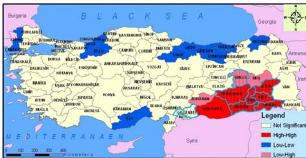
Figure 4. Choropleth Map of typhoid fever clusters with LISA and G statistics

According to LISA results Batman, Şanlıurfa, Diyarbakır, Bitlis, Siirt, Mardin and Şırnak provinces were determined as clusters. Figure 3 shows the results obtained from G_i^* statistical values; (selected province with turquoise color: p < 0.05 ) and results (red colored provinces indicate significantly high-high provinces) obtained with the second method LISA.