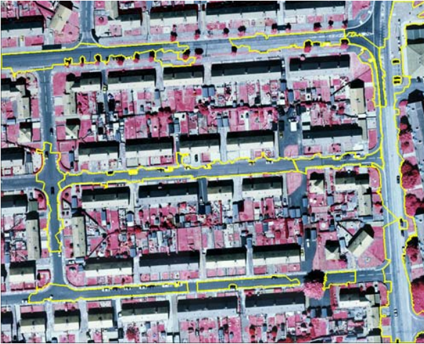
Figure 8. Road parts extracted in subset 1 with DSM (yellow).