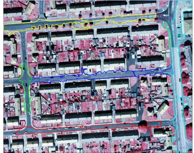
Figure 11. Road subgraphs (with DSM), subset 1. Different colours represent different road subgraphs.

Compared to the visual impression of the extracted roads, the completeness and correctness values are relatively low. The computed correctness suffers from leakage at the borders of the road parts and from the fact that pavements, which are often extracted as roads, are not included in the reference data. The computed completeness would also be increased by constructing road parts corresponding to the gap edges that were accepted in subgraph evaluation.