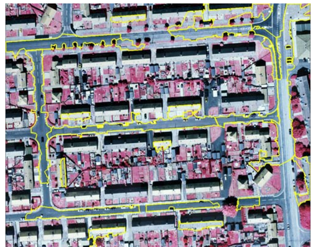
Figure 3. Road parts extracted in subset 1 (yellow).