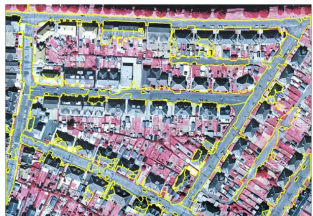
Figure 4. Road parts extracted in subset 2 (yellow).