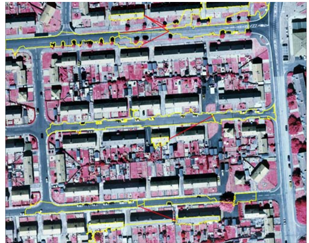
Figure 7. Road subgraph evaluation (without DSM) for subset 1. Discarded gap edges are displayed in red.