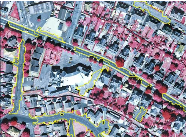
Figure 10. Road parts extracted in subset 3 with DSM (yellow).

Compared to the visual impression of the extracted roads, the completeness and correctness values are relatively low. The computed correctness suffers from leakage at the borders of the road parts and from the fact that pavements, which are often extracted as roads, are not included in the reference data. The computed completeness would also be increased by constructing road parts corresponding to the gap edges that were accepted in subgraph evaluation.