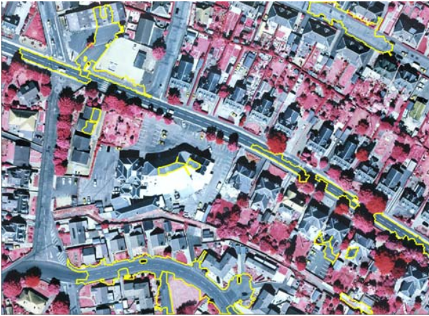
Figure 5. Road parts extracted in subset 3 (yellow).

The road parts are then assembled into road subgraphs as is shown in Fig. 6 for subset 1. There are three subgraphs which contain different hypotheses; these are resolved using linear programming, as described in Section 2.3. In Fig. 7, only these three subgraphs are shown with the edges that are removed displayed in red. The results show that the optimisation favours connections between road parts that are similar in colour and width and maintain a more or less straight continuation.