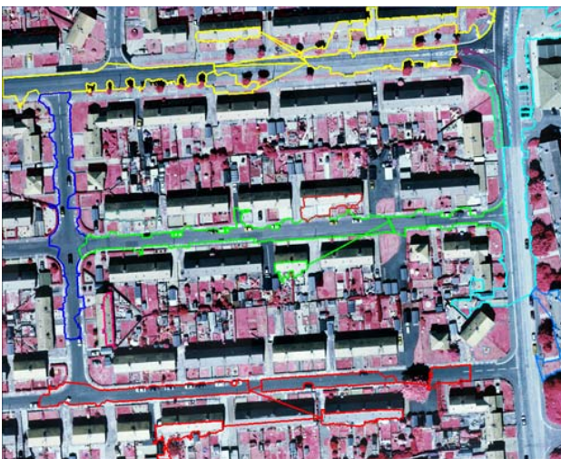
Figure 6. Road subgraphs (without DSM) for subset 1. Different colours represent different road subgraphs.

The road parts are then assembled into road subgraphs as is shown in Fig. 6 for subset 1. There are three subgraphs which contain different hypotheses; these are resolved using linear programming, as described in Section 2.3. In Fig. 7, only these three subgraphs are shown with the edges that are removed displayed in red. The results show that the optimisation favours connections between road parts that are similar in colour and width and maintain a more or less straight continuation.