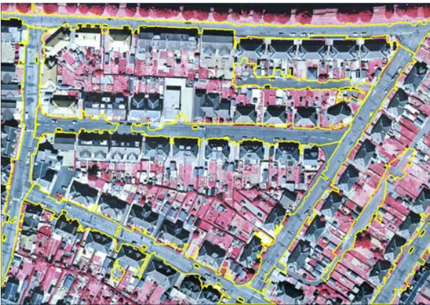
Figure 9. Road parts extracted in subset 2 with DSM (yellow).