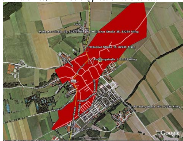
Figure 3. Flood hazard zone feature (fictitious) and address features provided by WFS

In the last years the number and intensity of natural disasters such as floods, earthquakes or avalanches increased. Many insurance companies therefore offer an extended insurance against natural hazards in addition to the residential building insurance in order to cover damages caused by natural hazards. However, before a specific customer can take out an insurance policy, the insurance company checks whether the building the customer wants to insure against natural hazards is situated within a natural hazard prone area such as a floodplain (see figure 3). Depending on the result of this check, the insurance company decides whether the building can be insured or not and if so, which is the applicable insurance rate.