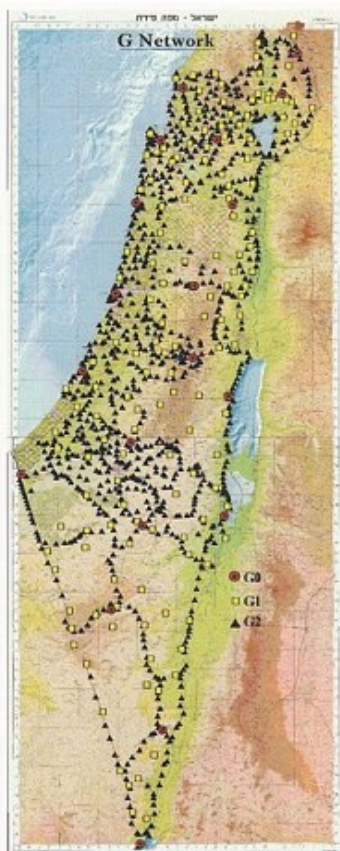
Figure 1: The first three levels of the Israeli geodetic infrastructure