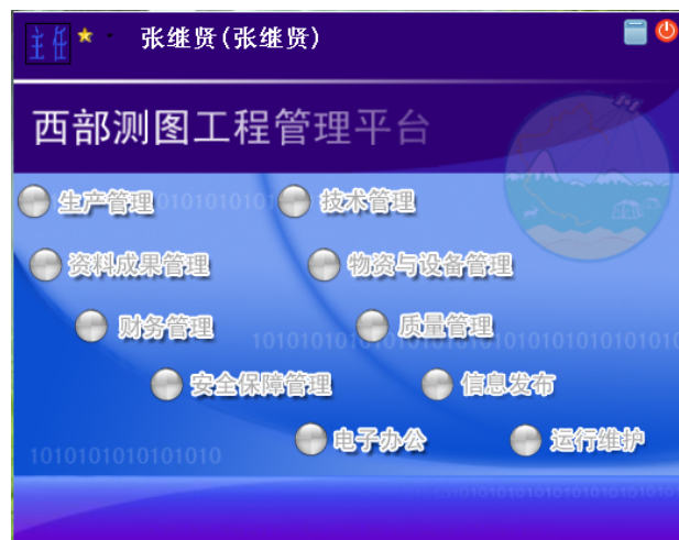
Fig3 Western Map Surveying project management platform main interface

After the design and development in 2008, this system is deployed and used in Western Map Surveying project department, units of undertake the project of each province, and take good effect.