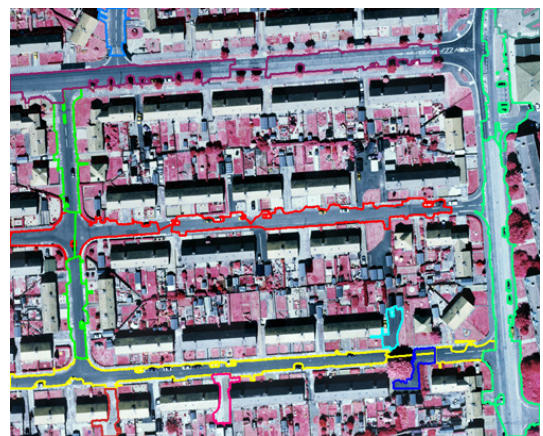
Figure 1. Accepted road subgraphs, subset 1 (Grangemouth).

Figures 1, 2 and 3 display the results from the subgraph generation for three of the subsets used for evaluation. Figures 1 and 2 show subsets from Grangemouth, whereas Figure 3 is taken from the Vaihingen data set. The subgraphs consist of the extracted road parts and the connecting lines found during the subgraph generation and evaluation. The results show the subgraphs after the evaluation, which means the road subgraphs consist of only one road string each. The subgraphs are depicted in different colours; roads that belong to the same subgraph have the same colour.