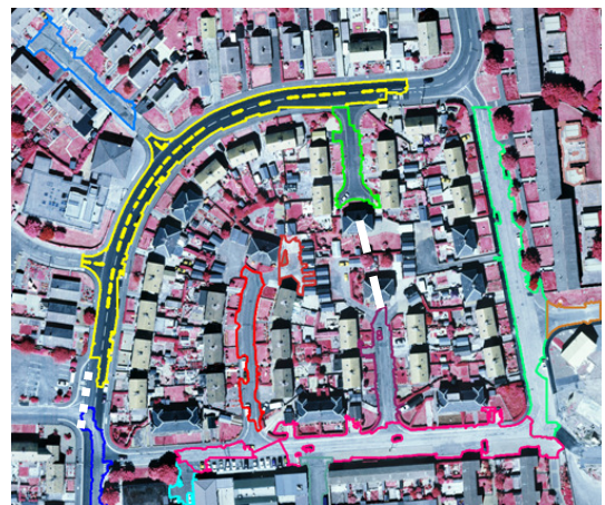
Figure 2. Accepted subgraphs, subset 2 (Grangemouth).

Large parts of the road network could be extracted as road parts. Areas where the extraction fails typically lie at the image border (most notably in subset 2), at sharp turns or where the appearance of the roads is disturbed by trees and shadows. False extractions are rare, thanks to the DSM; most of them are driveways or parking lots. After the subgraph generation, most road parts that lie on the same road are connected. In subset 2, two road parts were first connected across two buildings, but the connection was eliminated after the context object evaluation (white dashed line in Figure 2). One connection in subset 2 was missed (white dotted line in Figure 2).