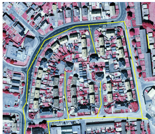
Figure 5. Road network, subset 2 (Grangemouth).