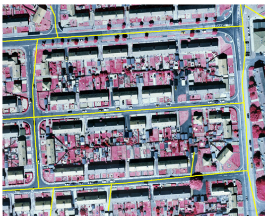
Figure 4. Road network, subset 1 (Grangemouth).