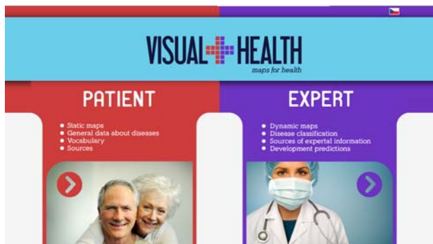
Figure 1: VisualHealth Portal

The results of VisualHealth project are published on the web portal ( http://zdravi.geogr.muni.cz ), only a part of this portal is in English, because the maps and other outputs are mainly destined for Czech users. The portal is divided into two parts – for patients and for experts (Figure 1). Both parts contain different types of thematic maps and other components like vocabulary or list of sources.