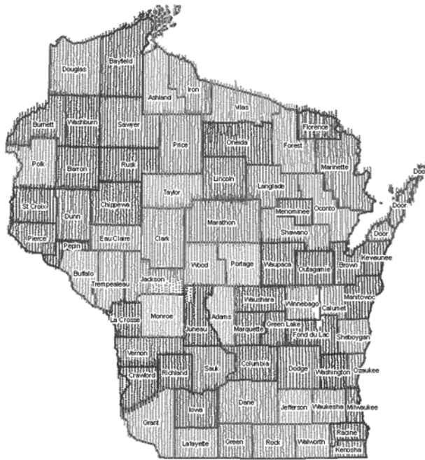
Figure 2. Extracted Photo Center Points for Entire State