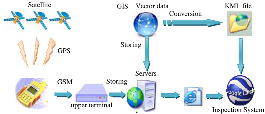
Figure 1. The Flow Diagram of 4G Integration Technology

function includes collection, storage, management, analysis, description and application of spatial data and geographical data. Specially, basing on geospatial database and using geographic model analysis method, it is an high-tech for storing and processing spatial information. First based on actual need, GIS can associate geographical location and attribute information perfectly and can provide the accurate output with illustrations and pictures; Second GIS integrates computer graphics and databases, and can provide the spatial and dynamics geographic information; Last, with its unique spatial analysis and visualization, GIS can provide various decision support.