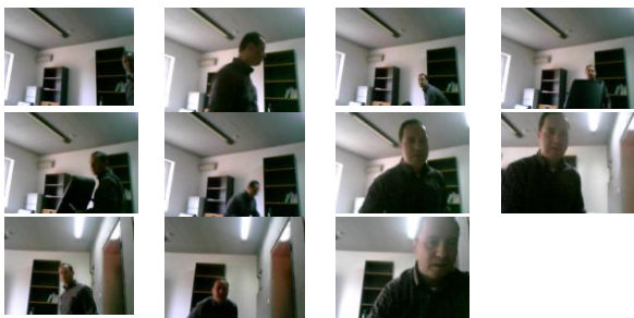
Figure 2. Characteristic frames for the 2 nd experiment.

Figure 1 shows a man who is moving in a room. Sometimes he is falling but the falls are detected by the system. He also makes other humans' activities, such as sitting or carrying objects. Moreover, sometimes he is approaching the camera. But in all cases, the fall detector algorithm works efficiently. In Figure 2, the man moves the camera to change the view. But even in this case, the background subtraction algorithm can efficiently identify the person and distinguishes falls from other humans' actions.