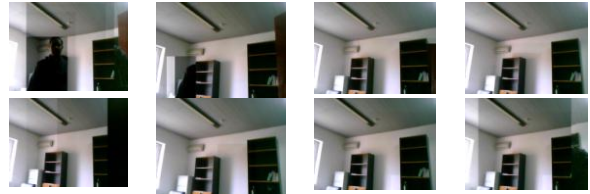
Figure 3. Characteristic frames for the detected as background region for the Experiment 1.

This is more evident in Figure 4 in which at a time the camera is moving and the background significantly changes, We can see that the proposed algorithm is very robust and it can detect the background even in such dramatic changes within very few frames. In addition, despite the complexity of the background content the algorithm remains very stable.