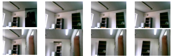
Figure 4. Characteristic frames for the detected as background region for the Experiment 1.

Figure 5 illustrates the estimate for the foreground object using a background subtraction methodology. We should stress that the goal of this paper is not to apply a very sophisticated moving object detection scheme. On the contrary, our goal is to identify falls in a real-time methodology. The proposed algorithm is very fast and can be implemented in real-time despite the small time constrains that a video stream demands. As we can see from Figure 5, at the first frames the algorithm fails due to the transition period in identifying the background. We should mention that we impose no restrictions on the initial content of the video. Then, the algorithm can efficiently detect the objects and but fails in case of sever background changes. This failure, however, is temporary since within very few frames the algorithms can self improved again.