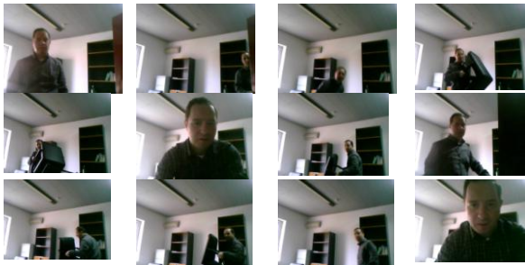
Figure 1. Characteristic frames for the 1 st experiment.

Initially, we test the performance of the proposed algorithm in our lab using two different types of experiments. In the first experiment, the background is modified by moving objects in it. In the second experiment, the camera is moving to severely change the background visual conditions. Figure 1 shows some characteristics original samples for the first experiment, while Figure 2 for the second.