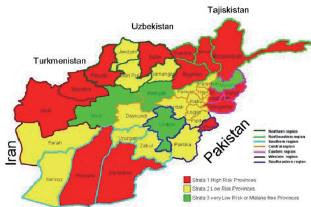
Figure 1 Provincial malaria risk strata. Source: Afghan Ministry of public health (Safi et al., 2009)

Presently, around 60% of the population in Afghanistan is at risk of malaria infection (Asha, May 2003). It is estimated that the highest incidence (23%) is in the Northeast region of Takhar province, followed by Kunduz province (13%). Current malaria strata for all 31 provinces in Afghanistan are shown in Figure 1 (Safi et al., 2009).