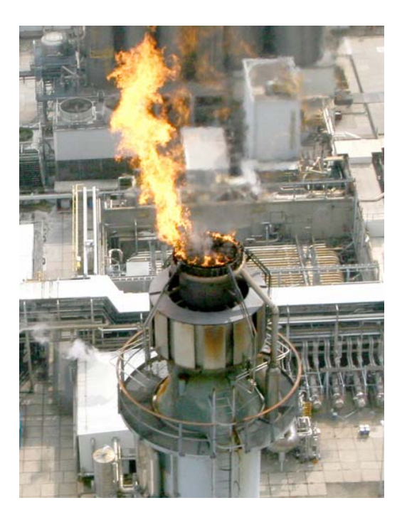
Figure 1. UAV Flare Inspection

MIRAMAP and E-Producties have just recently developed new commercial services to provide rapid emergency response operations, and to produce 3D vector maps using a small to medium size helicopter UAV. The specifications of the UAV and first project experiences are shared in this paper.