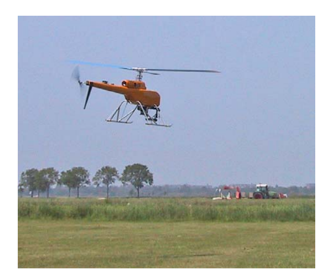
Figure 2. Helicopter UAV after Take-Off

and mission mode for pre-programmed flight trajectory tracking. Figure 2 shows the helicopter UAV. Its performance specifications are listed in Table 1.