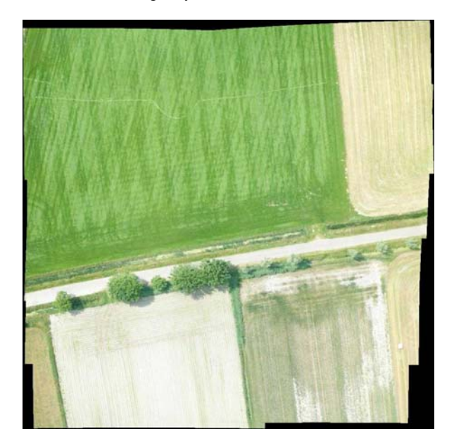
Figure 5. Seamless High Resolution Orthophoto Mosaic

The system enables collection, processing, and delivery of seamless high resolution orthophotos (Figure 5) and 3D vector maps to update existing databases. The benefits of this particular helicopter UAV over traditional aerial survey with large format cameras and/or terrestrial methodologies are its quick, safe and affordable map updates of areas with the size of a cross section or highway rest area.