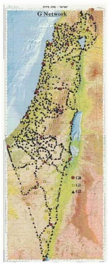
Figure 1: The first three levels of the Israeli geodetic infrastructure

SOI and the inter-agency committee for GIS seek to get further support for these activities from the government in the form of an official Israel government order to create a Metadata file in any spatial data transaction.