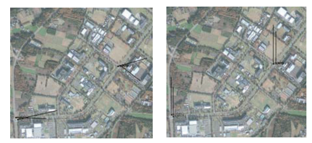
(a) planimetry(b) heightFigure 4. Checkpoint discrepancies at two point pairs showing systematic error trends.

The attained accuracy is at the ½-pixel level in planimetry and at the 1-pixel level in height. While the resulting georeferencing accuracy is quite acceptable, it is nonetheless below the best level that has been achieved in previous tests with GeoEye-1 (eg Fraser & Ravanbakhsh, 2009; Mitchell & Ehling, 2010). In this instance it is apparent that a combination of natural object point targets and sub-pixel localized systematic error has resulted in less than optimal results. The localized systematic error is indicated by object space coordinate residual vectors at point-pair locations being generally very similar in magnitude and direction, as exemplified in Figure 4.