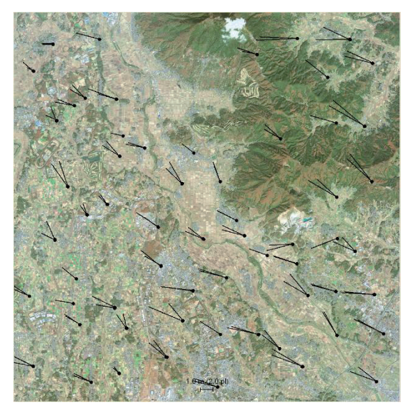
Figure 3a. Checkpoint discrepancies in planimetry from direct georeferencing.

Although the resulting checkpoint discrepancy values indicate a direct georeferencing accuracy within the GeoEye-1 specifications, the ranges of error nevertheless indicate the presence of positional biases, principally in the planimetric coordinates. The impact of these biases on the distribution of checkpoint residuals in object space is shown in Figure 3, where the error in planimetry is clearly systematic, while that in height is more random.