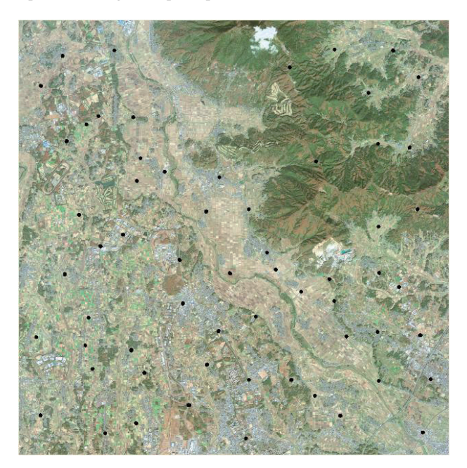
Figure 1. GCP/Checkpoint configuration, Tsukuba Test Field.

Image-identifiable ground features, most of which were road markings, were used as ground control (GCPs) and/or checkpoints. These were established at 69 locations, there being two distinct points separated by 10-50m at each location. The use of point-pairs allows a better assessment of any localized systematic errors within the georeferencing. The GCPs were surveyed by differential GPS, and not all proved measurable in the imagery, due to local haze conditions, shadowing and saturation in some cases of white road markings. A total of 115 points were deemed suitable for use as GCPs or checkpoints in the experimental testing. The configuration of GCPs and checkpoints is shown in Figure 1, while Figure 2 shows two representative ground point pairs.