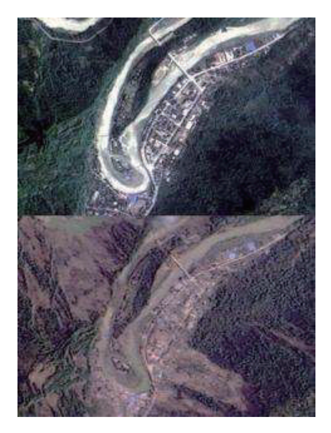
Figure 3. Beichuan County of Sichuan Province, China, before (above, taken in 2006) and after (below, taken on 14 May 2008) the earthquake

On 12 May 2008, an earthquake of Richter magnitude scale 8.0 occurred in the Wenchuan County of Sichuan Province, China. NSPO immediately scheduled FS2's first priority to observe the status of the epicenter and its surrounding areas. The images taken were processed and provided to China free charge for rescue and relief purposes at the first time without any delay. It is seen from Figures 3 and 4 that the Beichuan County is almost completely destroyed. The Dujingyan Irrigation System, a UNESCO registered World Heritage Site, is basically in healthy condition. However, the buildings including some ancient temples located at its surrounding area are severely damaged by the earthquake. [13,19]