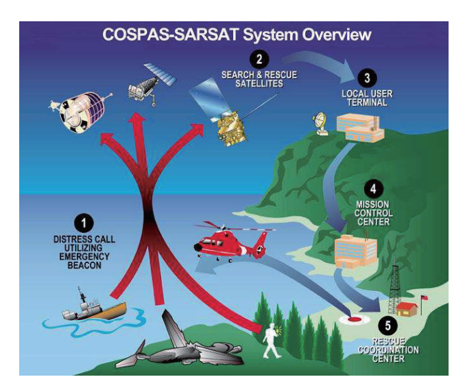
Figure 1. COSPAS-SARSAT system overview

- a network of 30 Mission Control Centres to distribute distress alerts and location information to SAR authorities, worldwide.