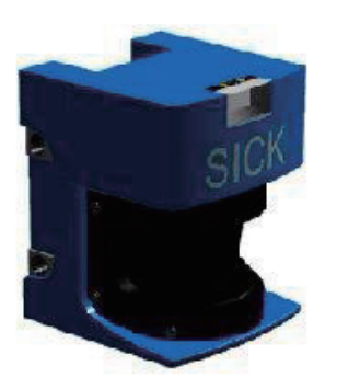
Figure 2. The SICK Laser Measurement Sensor (LMS) 200