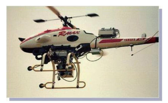
Figure 1. Radio control (RC) helicopter made by YAMAHA Motor Co., Ltd.

The purpose of this study is to develop a methodology for the